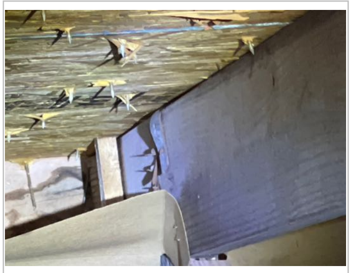
Strap- Opposing Side