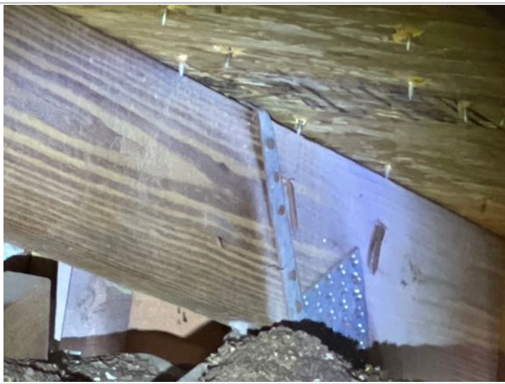
Strap- Anchor Side